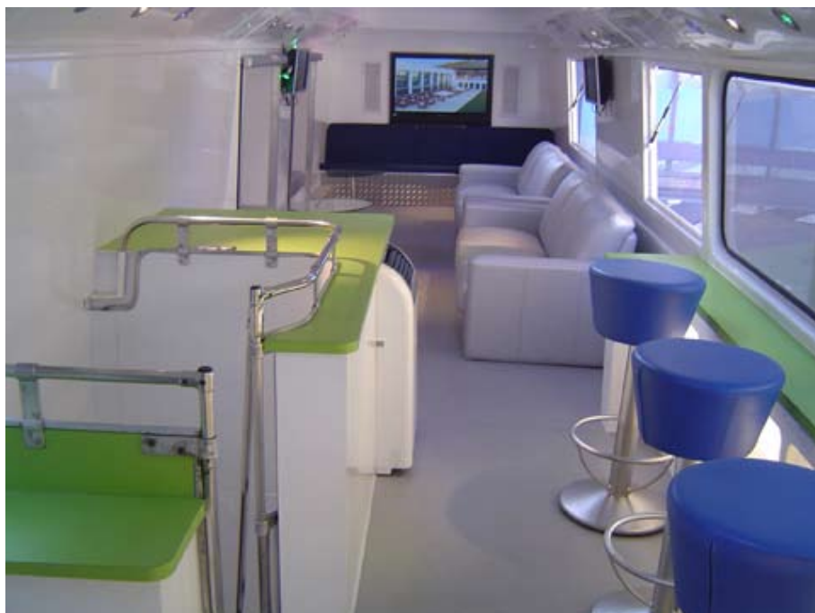
Above: Bus Business's 11m Metrobus has been specially converted for presentations.

BusBeds are event venues rather than travelling hotels, so clients must organise